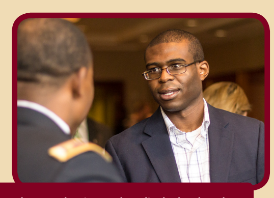
More than 15 doctors, dentists and medical school students attended Tour of Diversity program at Rowan University.

The Tour for Diversity in Medicine is part of Hip-Hop Health Inc. and has reached over 1,400 students since its inception in 2012. Their mis-