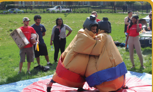
Students took a break from studying to participate in stress relieving activities.

Co-sponsored by the Office of Health Professions, Pre-Health Club, Pre-Allied Health Club, the Biology Club and the American Chemical Society, Study Madness hopes to establish a culture in which students understand the values of studying in a community atmosphere.