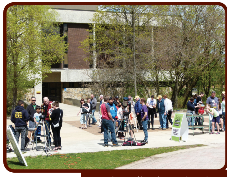
Visitors line up to safely view the sun on Explorer Sunday

Following Astronomy Night, Rowan played host to Explorer Sunday. Various family-friendly activities took place across campus, many of which were offered at Science Hall. Many of the youngest visitors enjoyed creating hexaflexagons and a Menger sponge with members of the Math Team, while others took part in