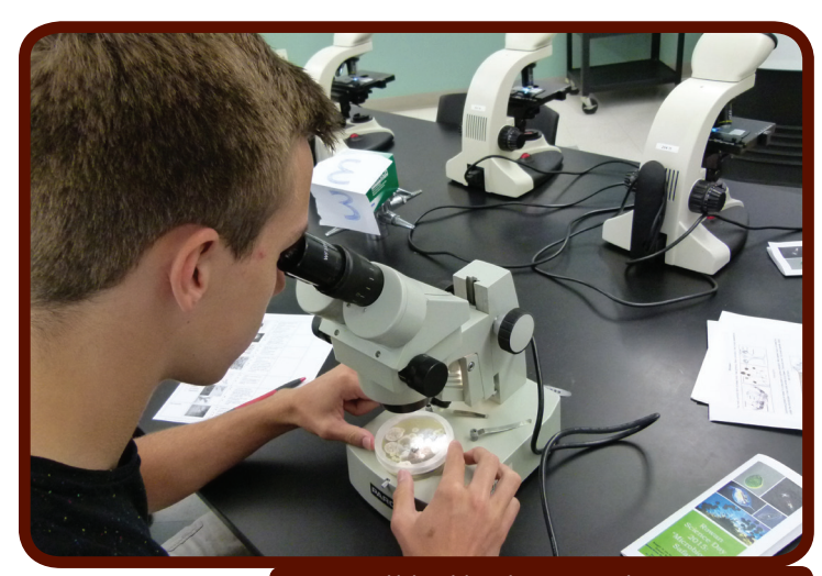
Discovering moldy bread through a microscope during CSM's Science Day, which welcomes high school students from across South Jersey.