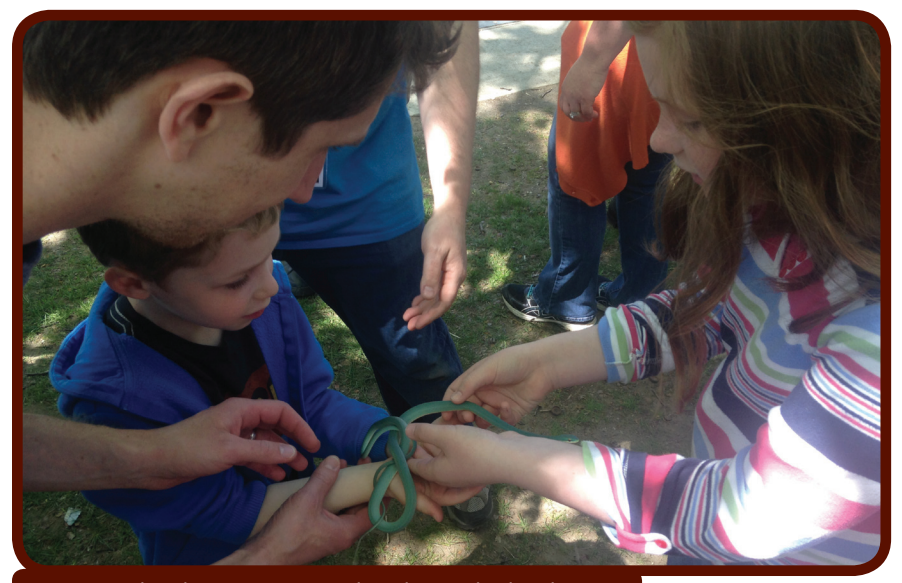
Visitors meet reptiles at the Rowan University tent during the Carnival on the Parkway as part of the Philadelphia Science Festival.